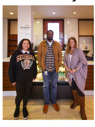
We served 4,223 clients and their families.

We provided a total of 75,070 services to them.